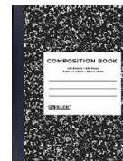
Composition book x2